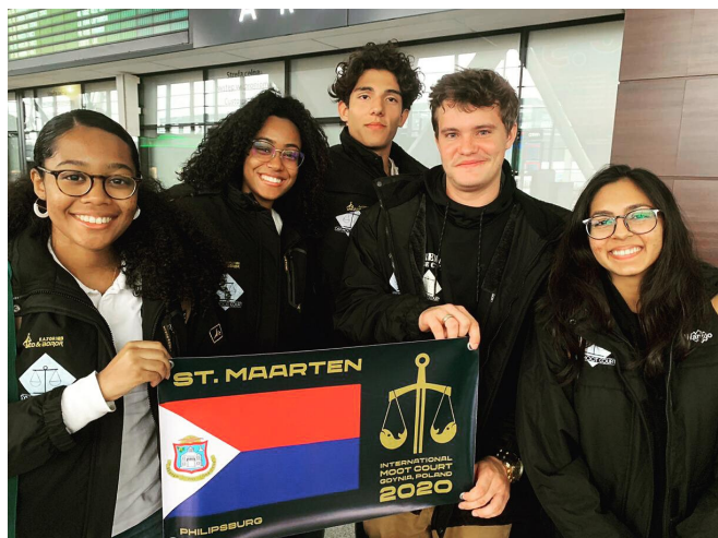
ON THE PICTURE: SINT MAARTEN TEAM

Students from 15 different countries will compete to showcase their debating talents and knowledge of international law in front of legal professionals and real judges of the International Criminal Court (ICC).